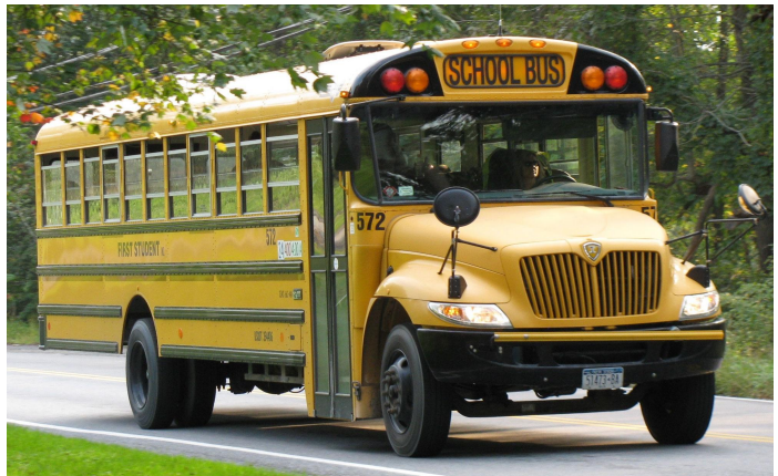
Riding the Bus When we use public transportation we use fewer cars overall. Fewer cars means less pollution and happier trees and animals.