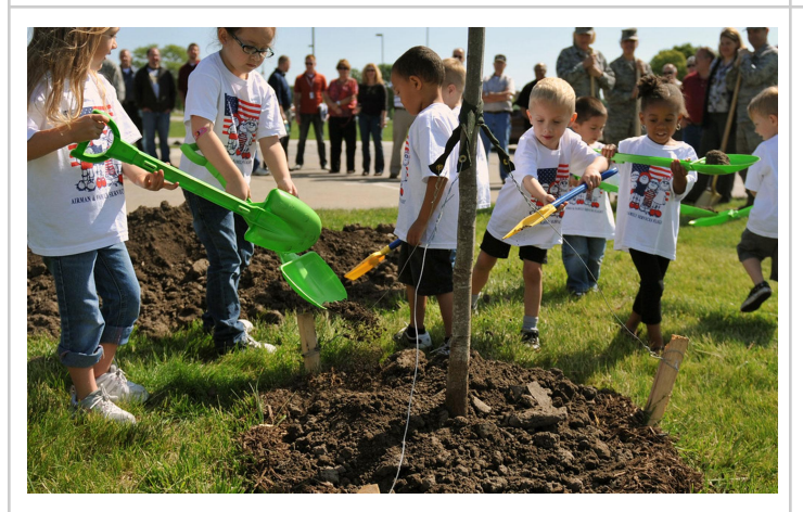
Planting a Tree Trees give us oxygen. If you plant a tree, you are giving others a chance for nice, clean air!