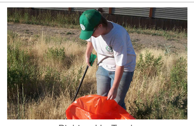
Picking Up Trash If every person refused to pick up even just one piece of trash, our school would be covered in garbage! Third line.