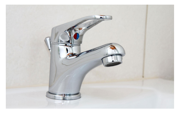
Turning off the water when brushing your teeth You can save over 10 gallons of water by turning it off!