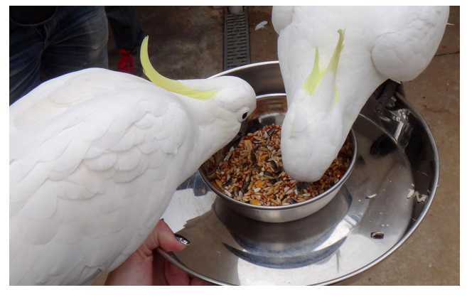
Feeding an Animal Pets rely on us to keep them fed, clean, and healthy.